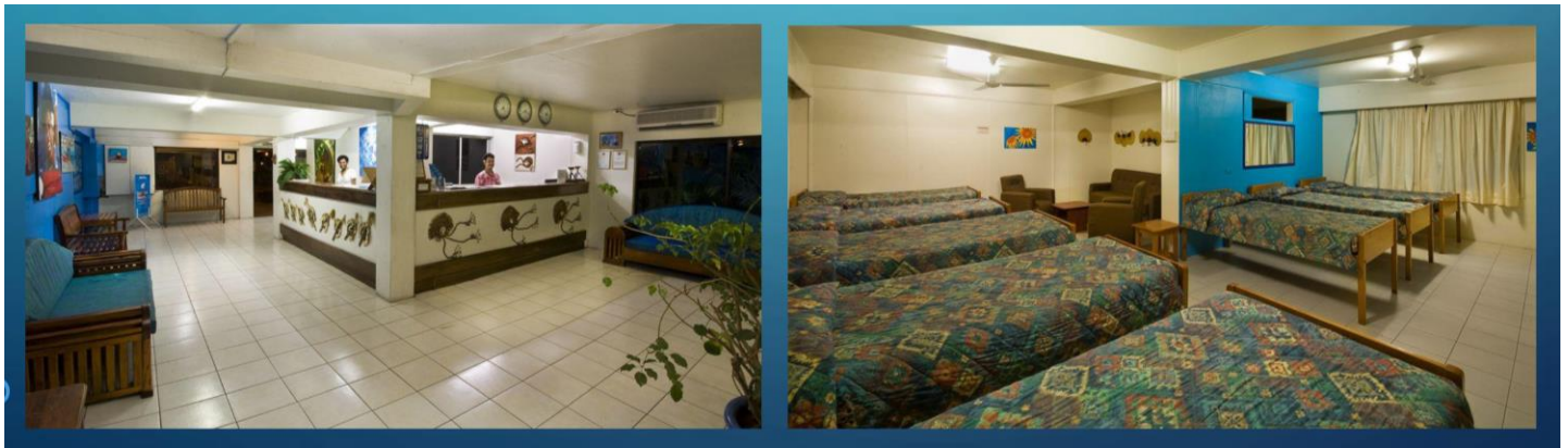
Overnight Nadi: “Nadi Bay Hotel” (Meal on flight-D)