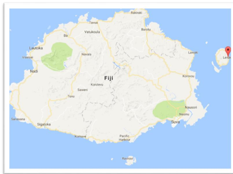
← Levuka Ovalau Island